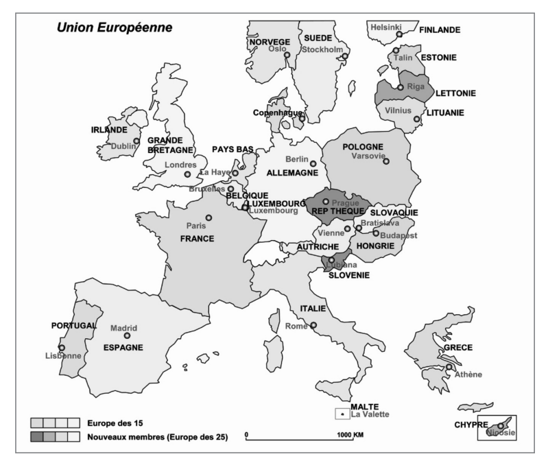
Figure 2: Map of European Union (Source: K. Dahou, Coopération transfrontaliere: vers un dialogue euro-africain, WABI Working Paper DT/15/04, 2004, p. 13).